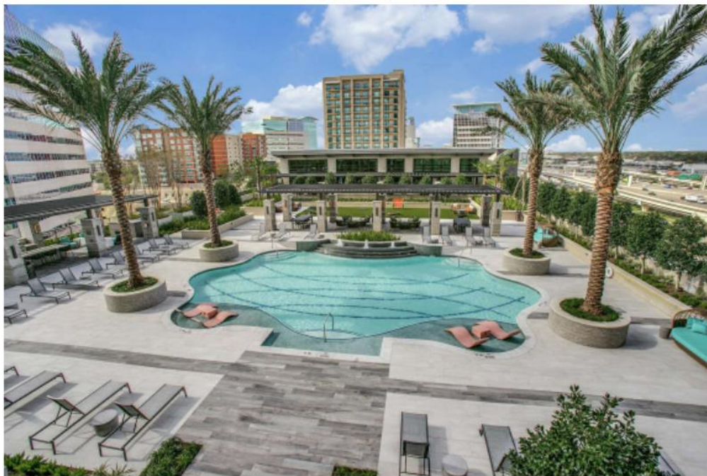
The McKinley at Memorial City, a 25-story, 278-unit apartment tower at 9757 Katy Freeway, was completed in July 2021.

With the recent completion of downtown's Texas Tower and Hewlett Packard Enterprise's new campus in Spring, only 820,000 square feet of office space is under construction in the Houston area, according to Transwestern. The biggest project is Skanska USA Commercial Development's 28-story 1550 on the Green in downtown.