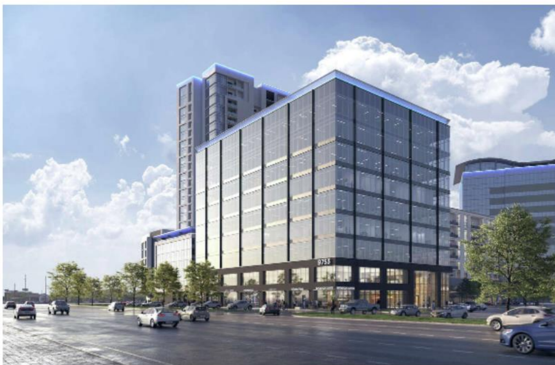
— MetroNational is developing a nine-story, 190,000-square-foot office building at 9753 Katy Freeway in Memorial City. MetroNational

The 190,000-square-foot building will offer first-floor restaurant and retail spaces and a location next to the Lawn, a new 30,000-square-foot greenspace for entertainment and community events, and Memorial City Mall. Designed by Kirksey Architecture, the glass building features a two-story lobby with a 27-foot art wall.